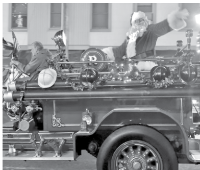
Santa closes out the parade with a wave during the 2022 Home for the Holidays event.

We settled in Ramsey, New Jersey. With neither of us being from the state originally, it felt both foreign and familiar at the same time. We soon got to know and love our new hometown. Quickly, we began to take advantage of all the town had to offer, including the town pool, near-by hiking trails, gourmet restaurants, and seasonal events.