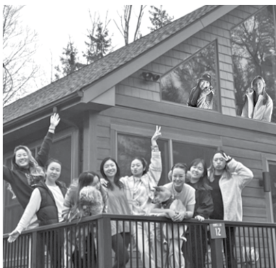
Girls cabin trip.

E very year around the holidays, all my girlfriends would commit to a day to spend together. We’ve now hit the age where everyone is at a different point in their life – some starting out in their career, others in a relationship or married with kids. Yet, we’ve always made time for each other year after year to show that we continue to care for